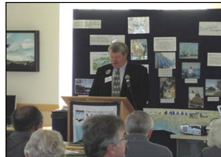
Maine Senator, Dennis Damon